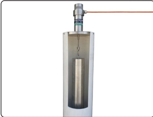
[Outline of VW weir monitoring system]